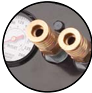
Control Panel with 2 "universal" Couplers