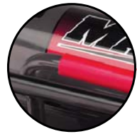
4 Gallon "twinstack" tank