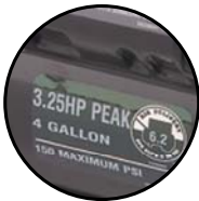
High Output Motor