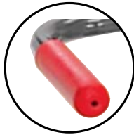
Easy Grip Carrying Handle