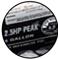
Quiet 1,725 RPM Motor