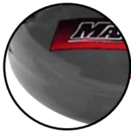
4 Gallon "pancake" Tank